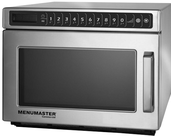
Model MDC182 shown